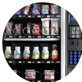
Maximum flexibility with a reduced footprint