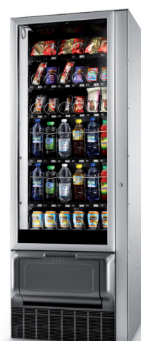
Available in the Slave Version with two different layouts

Necta reserves the right to alter specifications without previous notice.