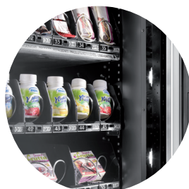
Stratified temperature inside the cell