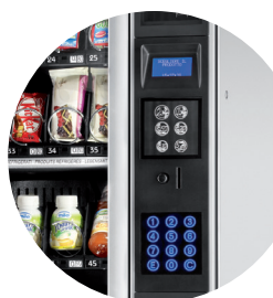
Refined design with high tech details